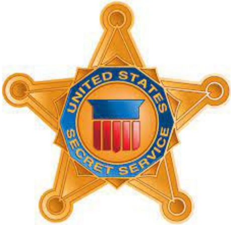
U.S. Secret Service